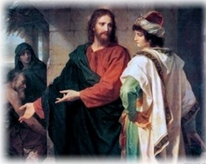
Christ and the Virgin Mary Hans Holbein the Younger 1535